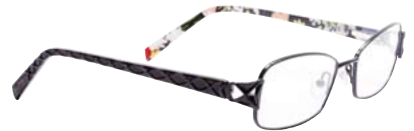
Madison Poppy Fields (PFD) 53-17-135