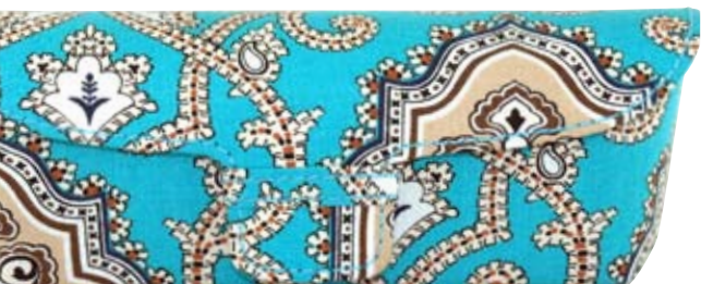
Totally Turq case