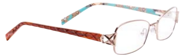
Madison Totally Turq (TTQ) 53-17-135

Receive a FREE Vera Bradley Small Cosmetic with each purchase of a Festive Collection I understand if I return any of the Vera Bradley product from this order, I must also return the gift or be charged for it