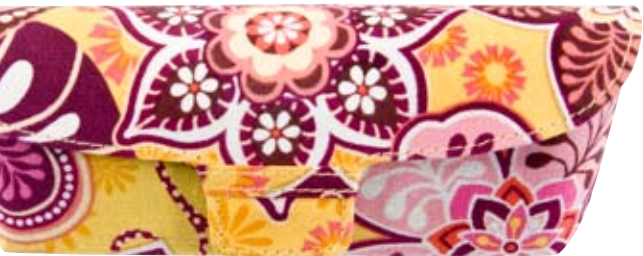
Bali Gold case