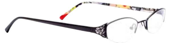
VB 3011 Poppy Fields (PFD) 50-18-135