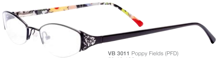
VB 3011 Poppy Fields (PFD) 50-18-135