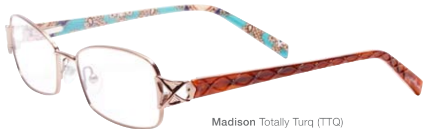
Madison Totally Turq (TTQ) 53-17-135