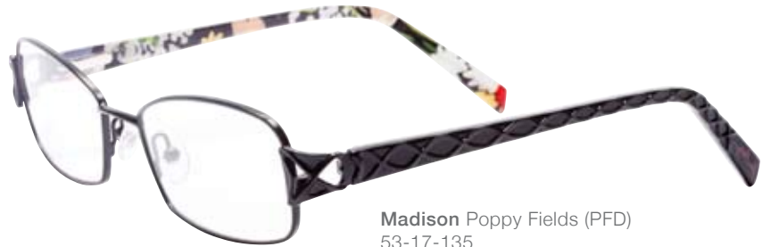
Madison Poppy Fields (PFD) 53-17-135