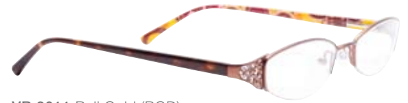
VB 3011 Bali Gold (BGD) 50-18-135

Please send me _____ of the Festive Collection. (QTY)