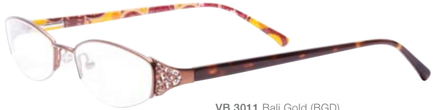
VB 3011 Bali Gold (BGD) 50-18-135